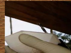
Figure 8: Sawdust collection

These are the most conventional and accurate methods for analyzing metals, but the methods are also time consuming and require a laboratory facility. This method requires the collection of sawdust samples which are then digested in high concentrated acid (EPA: 3050B) to be liquefied. The digested sample is analyzed for the CCA-chemicals using an AA or ICP.