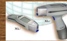
Figure 10: One type of XRF unit

It is the most innovative tool but pricey. XRF analyzers have been used by wood treating plants to test retention levels. It can analyze 12 metals including arsenic, chromium, and copper in a second.