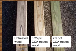
Figure 1: Preserving Effects of the CCA Chemical Added to Wood

What is a chemical preservative? It is used to protect wood from organisms such as fungi, termites, and natural weather conditions. By protecting the wood, it expands its life. Figure 1 is a picture of three pieces of wood that have been placed outside for 5 months. Wood without preservative deteriorates noticeably faster outside.