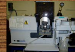
Figure 9: Atomic absorption spectrometer