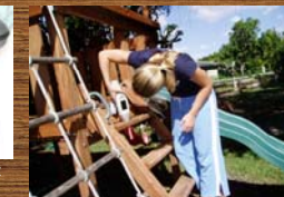
Figure 11: Analyzing a playground using an XRF unit