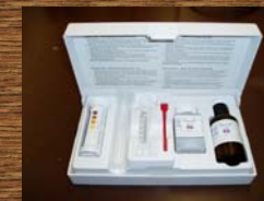
Figure 6: Arsenic test kit

The Arsenic test kit can be used for the detection of arsenic in treated wood. The procedure is relatively simple.