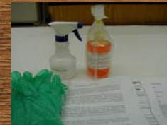
Figure 4: PAN Indicator

The PAN indicator stain identifies copper in the treated wood. The test has a rapid reaction time and a distinctive color. Because of its simplicity and reasonable cost, it is very practical for screening copper treated structures.