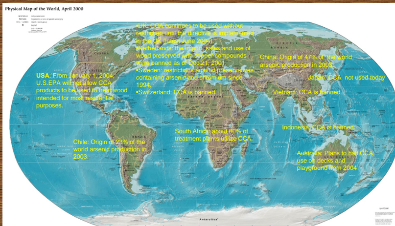
Figure 3: CCA world map