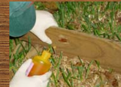
Figure 5: Testing a playground using the PAN Indicator