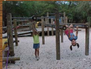
Figure 2: Children at a CCA-treated equipped playground

What are the rising issues associated with CCA-treated wood? Since arsenic and chromium are human carcinogens, CCA-treated wood may not be safe for those who come in frequent contact with it. A particular concern is associated with young children, due to hand-to-mouth behavior while playing on the CCA-treated playgrounds (Figure 2). Also, some exposure can occur through the absorption of arsenic through skin.